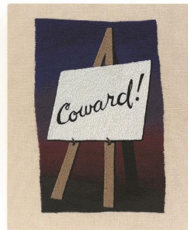
“PAINTED MYSELF INTO A CORNER.” 2022 FREEMOTION MACHINE EMBROIDERY ON LINEN, 25,5x20 cm | 10x8 IN UNIQUE