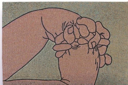
“GOTTEN KNOTTED.” 2022 FREEMOTION MACHINE EMBROIDERY ON JACQUARD WEAVING, 50,8x76,2 cm | 20x30 IN UNIQUE